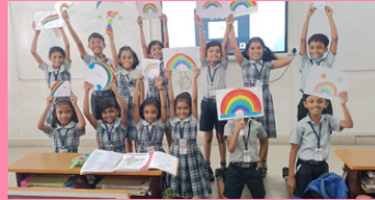
മഴവില്ലിനോട് സംസാരിക്കാം Class III