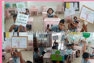
മരം ഒരു വരം -Class II