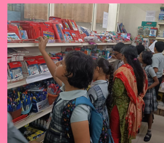
Class IV -Visit to BPCL Store Independent , budgeted, listed shopping