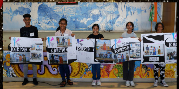
One day Camp for Standard VIII at CRS