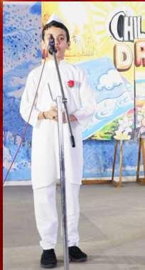
Little Nehru igniting young minds