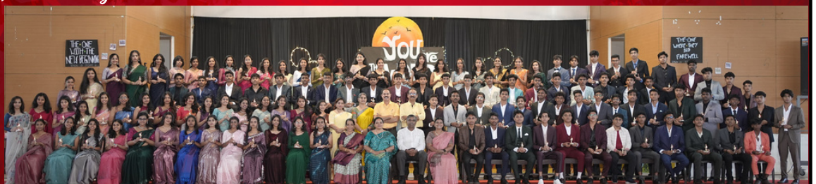
Class XII students at the threshold of a new beginning