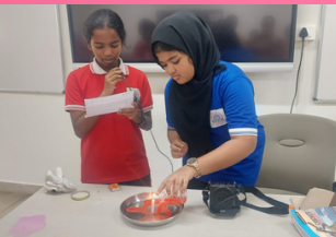
Experimenting with properties of air - Class VI