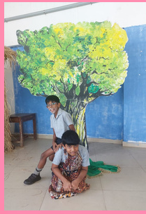
"The giving tree" Dramatisation Class IV