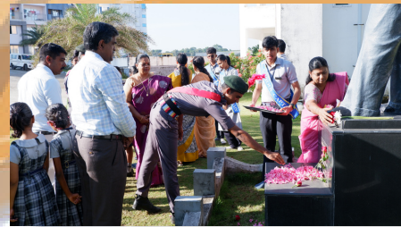
Offering floral tribute to Dr. B.R. Ambedkar