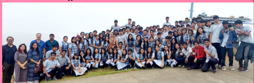
Class XII picnic to Kuttikaanam