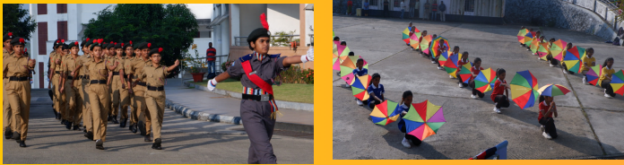
Display by students of Classes 6, 7 & 8