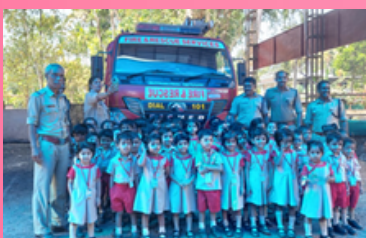
KQ - Visit to Fire Station