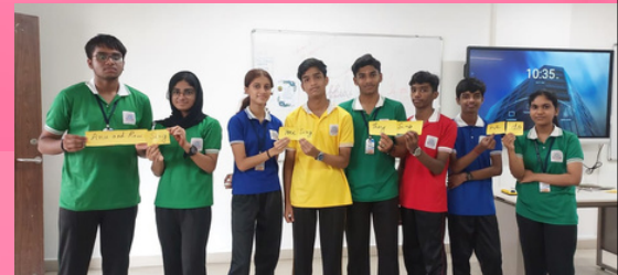
Fun with idioms & phrases, Tenses-Class XI