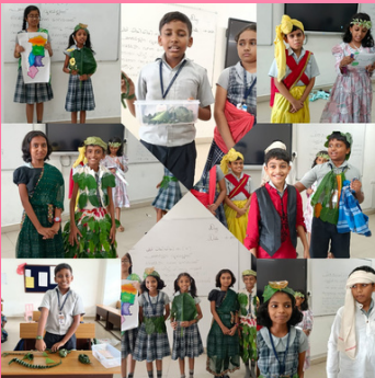
പ്രകൃതിക്കിണങ്ങി ജീവിക്കാം -Class V