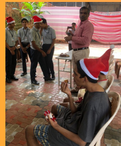
CRS donated groceries to 'Mother Care' orphanage in Choondy-Spreading the warmth of Christmas