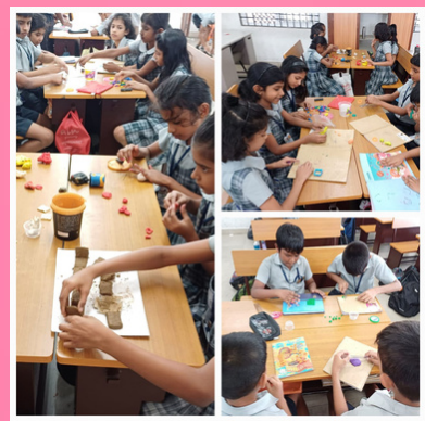
Brick making to construct eco-friendly houses - Class III