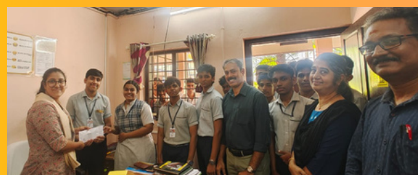
A Ray of Sunshine - Student representatives of class 12 gifting their token of love to Thabeetha Old age home