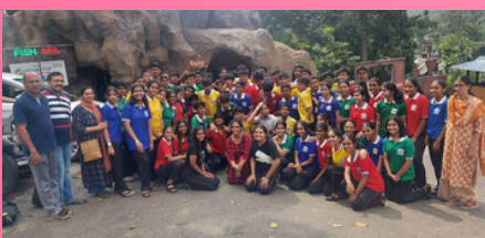
Class X picnic to Wonder Valley, Munnar