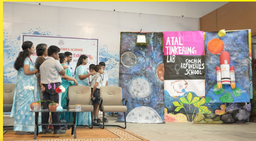
Honing scientific temper