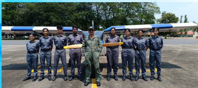
Flying camp at Naval Base - 3K Airwing