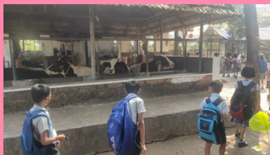
Class II - Visit to Ottathakkal farm, Puthiyakavu