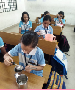
Activity using water to sensitize children about the need to prevent wastage of water- Class III