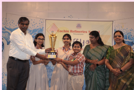
Overall Champions - Vidyodaya School, Thevakkal