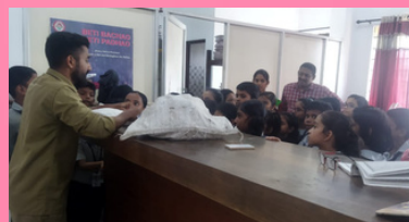
Class III - Visit to Post Office