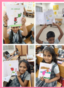
എന്റെ വീട്ടിലെ പനിനീർപ്പൂവ് Class IV