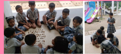
Bringing nature in to classroom-Class I